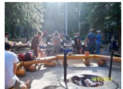
Figure 1 - Pictures from Gwillim Lake 2012